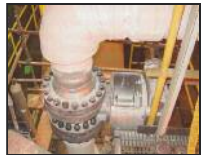
Extraction Steam Applications for Isolation and Check

Factory Authorized Repair & Maintenance Center for all your actuators, level gages, mixers, pumps and valves. Baro has a complete machine shop and fabrication facility for all your repair and maintenance needs. Baro Repair Center has certified and trained personnel to repair your products back to Factory New Condition. All repairs come standard with the Manufacturer's Warranty Policy. Contact Us 24 Hours a day, seven days a week for repair and maintenance.