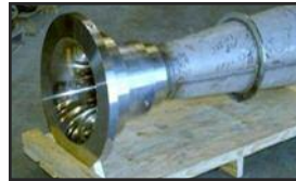
ASME PTC-6 Flow Nozzle Test Section